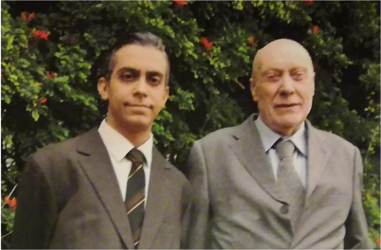
Photo of Ettore Majorana on 5 August 1996 with Rolando Pelizza, constructor of the machine which made it possible to put Ettore's theories into practice.